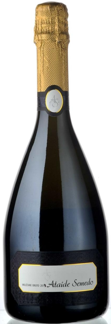
Ataíde Semedo Millésime Bruto, 2013 ATAÍDE COSTA MARTINS SEMEDO UNIP. LDA.