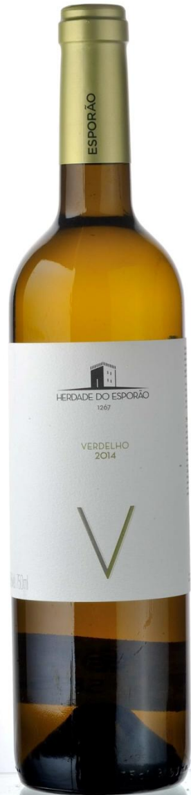
Herdade do Esporão Verdelho, 2014 ESPORÃO SA